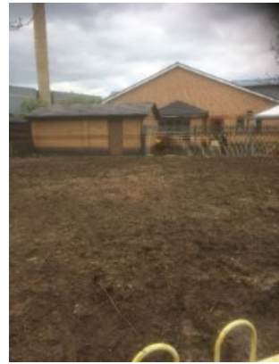
The space cleared by the DIY group from September to November 2018