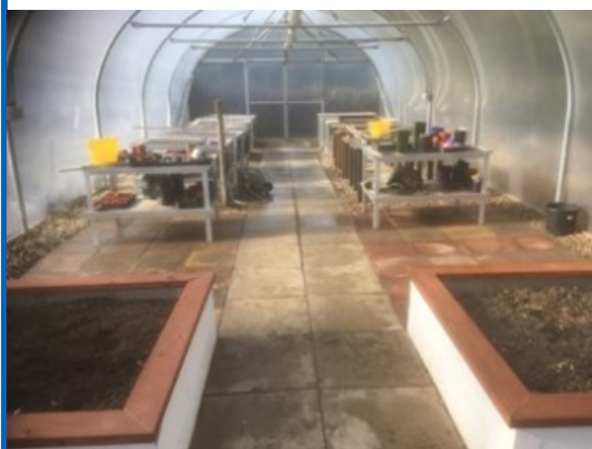
The NEW Stephenson Polytunnel October 2019