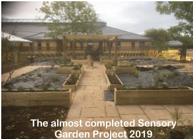
The almost completed Sensory Garden Project 2019