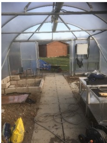
The Stephenson Polytunnel September 2018

The new DIY group have successfully completed a make over of the Stephenson Polytunnel, this was started over a year ago by the previous group. The new look space now has 2 raised beds for planting and has extra paving to make it more accessible for our students who use a wheelchair. It's all set for next Spring's growing season.