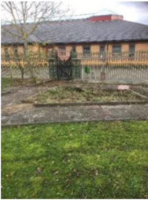
The original space October 2017

The DIY group is keen to add the finishing touches to the new Sensory Garden which is approaching completion after the hard work that's been done by the Shaw Trust. Giving the outer fence of the sensory garden a much needed lick of metallic paint is first on our list but there'll be plenty more for us to do as we approach planting season next Spring.