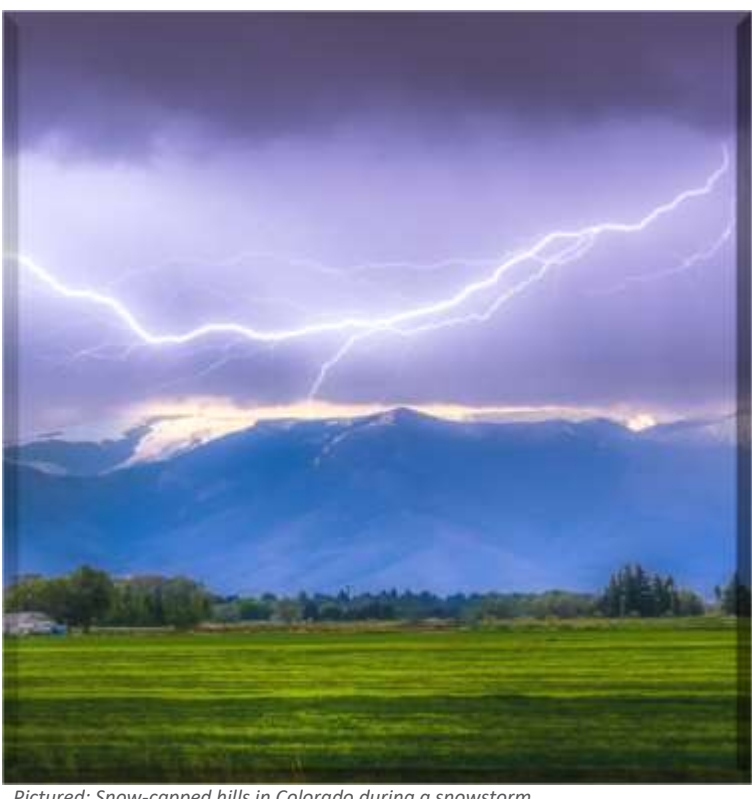
Pictured: Snow-capped hills in Colorado during a snowstorm

An unusual phenomenon known as 'thundersnow' has been observed in the UK and other countries situated in the northern hemisphere during the recent winterv weather. Thundersnow occurs when thunder and lightning mix with heavy snowstorms, causing loud claps that sound like explosions in the sky. These have not been the only unusual flashes of light to be observed in January 2021. In the Pacific Ocean, close to the small island of Nauru, blue jets of light have been spotted by astronauts on the International Space Station (ISS). Lightning can often be seen from ISS, which orbits the Earth far up in space at an altitude of 350 kilometres. But these strange blue jets strike upwards instead of downwards, sometimes as far up as 50 kilometres from the Earth's surface into the stratosphere. The stratosphere is the second layer of the Earth's atmosphere, where air is much thinner and calmer.