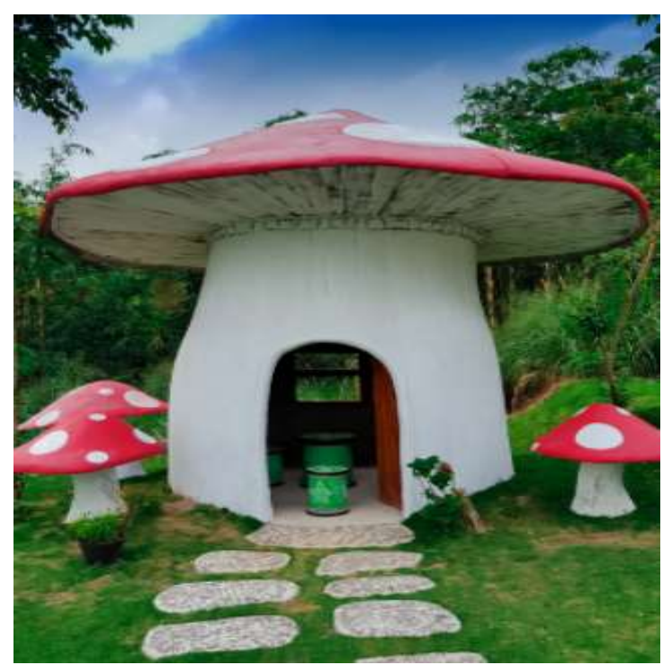
Pictured: Hobbiton is a popular New Zealand tourist destination

Governments around the world have been urging citizens to enjoy a holiday in their own country this summer, sometimes referred to as a 'staycation'. The citizens of New Zealand (NZ) are being urged to do the same. But the country's tourist board has taken it one step further with a funny advert by a famous comedian, Tom Sainsbury. Thousands of tourists post the same views of their trip on social media such as photos of a 'summit spreadeagle' where they photograph each other at the top of Mount Cook with their arms flung wide. NZ's tourist agency has said that this is boring and lacks imagination, so they are offering a travel voucher worth 500 NZ dollars to the winner of a competition on Twitter, using the hashtag #DoSomethingNewNZ, for more exciting photos of tourists posing at less well-known destinations across the country. If you were in NZ, what would yours be?