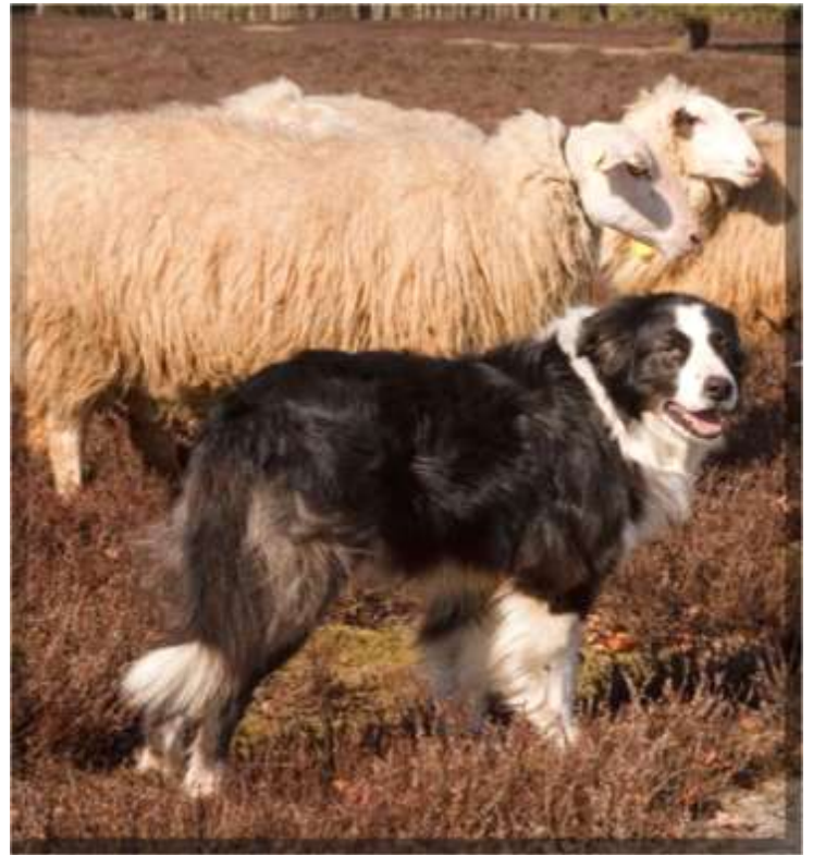
Pictured: A sheep dog herding sheep