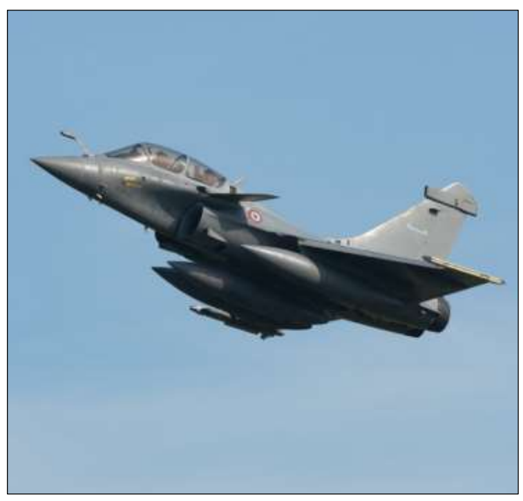
Pictured: A Dassault Rafale jet plane

A 64-year-old man was given a surprise gift of flight in a Dassault Rafale (meaning burst of fire), a French twin-engine, canard delta wing, multirole fighter aircraft, by his colleagues to celebrate his retirement. Just after the jet had taken off at Saint-Dizier 113 air base, the passenger was ejected from the back of the plane. An investigation into the incident which has just been released by France's Bureau of Enquiry and Analysis for Civil Aviation Safety, has confirmed that he was so startled when the plane took off that he accidently grabbed the handle that releases the Martin-Baker MK16 ejection seat to steady himself! This caused him to self-eject with his seat, being thrown from the aircraft, he then parachuted down to the ground and landed safely in a field. The pilot performed back-up actions and was then able to land the plane.