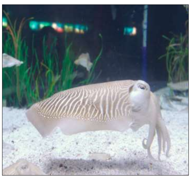
Pictured: A typical cuttlefish, photo by schmeeve.

New research by the University of Cambridge's department of psychology, shows that cuttlefish choose their daytime food based on what they think they'll be eating in the evening. 29 European common cuttlefish, who have a unique internal shell called the cuttlebone, eight arms and two long tentacles, were tested by scientists. The marine creatures love eating shrimp and if they know it's available in the evening, they will eat fewer crabs during the day. When served one shrimp every evening, the cuttlefish became more selective during the day and ate fewer crabs. When they were fed other foods in the evening, the cuttlefish adapted and ate more crabs during the day. The researchers said the cuttlefish's large central nervous system helps it remember things that have happened and to use that information to modify their behaviour.