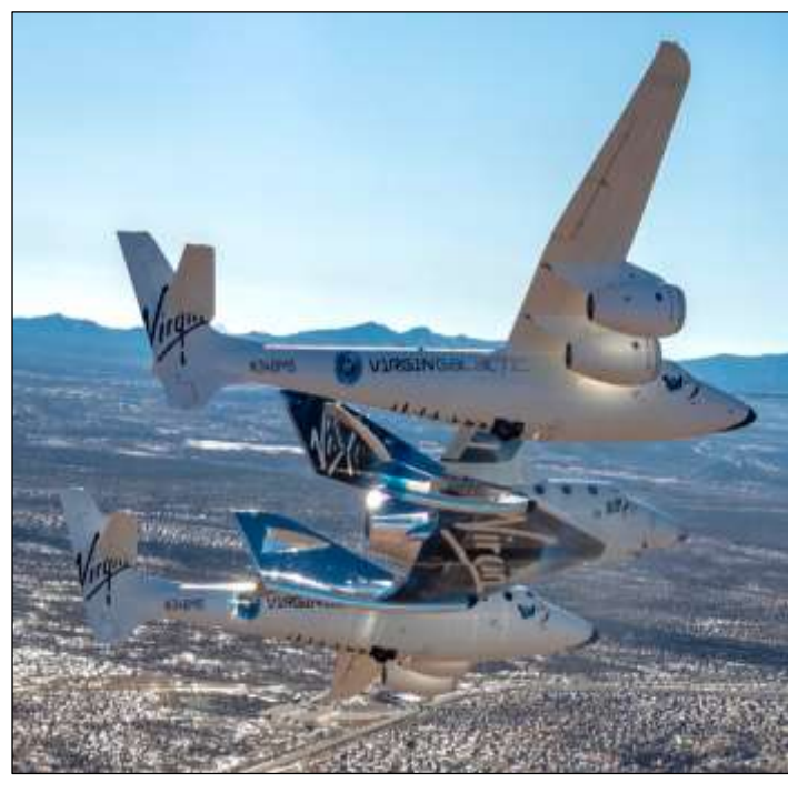
Pictured: Virgin Galactic SpaceShipTwo Unity

Virgin Galactic has relocated SpaceShipTwo 'VSS Unity' to its spaceport, in New Mexico, for preparations ahead of commercial flights. VSS Unity is a SpaceShipTwo-class suborbital rocket-powered crewed spaceplane. After it's February 2019 flight to space, VSS Unity began to undergo modifications including the installation of the commercial cabin. VSS Unity will now perform a series of test flights above the desert. Some of these will see it dropped from altitude to simply glide back to the runway. Others will involve firing its rocket motor to power skyward. Virgin are moving towards beginning a commercial service which will enable passengers to experience a few minutes of weightlessness, in near zero-G, around the top of the rocket ship's climb.