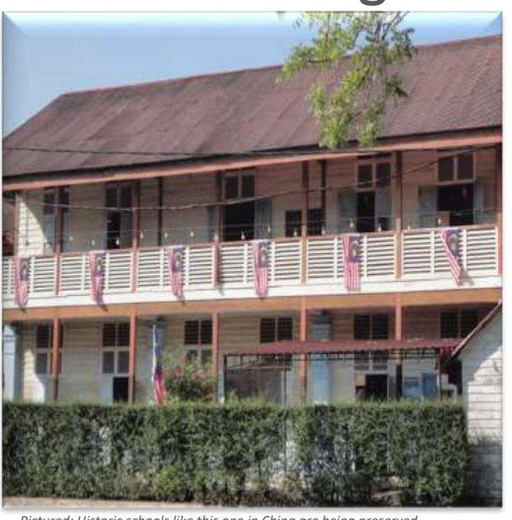
Pictured: Historic schools like this one in China are being preserved

Residents in the Chinese city of Shanghai may have thought that their eyes were deceiving them last month when an 85-year-old primary school looked as if it might be walking! Historians were keen to preserve the old structure but the space was needed for a new commercial and office complex. Engineers attached nearly 200 mobile supports under the fivestory building, lifting it completely off the ground. They relocated it using the new technology, named "the walking machine." The supports act like robotic legs. They split into two groups, which alternately rise up and down, imitating the human stride. The company, Shanghai Evolution Shift, developed the new technology in 2018. "It's like giving the building crutches so it can stand up and then walk," a spokesperson for the company said. The commercial office buildings will not be completed until 2023.