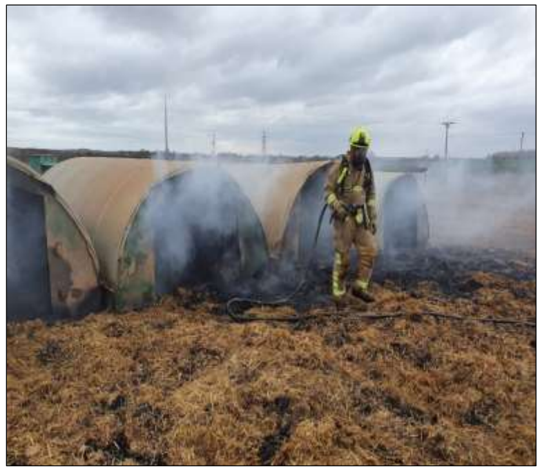
Pictured

A pig pen was accidently set on fire by its inhabitants after a pedometer, which had been eaten and excreted by a pig, reacted with the pig pens contents and set on fire. North Yorkshire Fire and Rescue service Tweeted, "Should be an oink not a tweet. Tadcaster and Knaresborough fire crews attended a fire to 4 pigpens near Bramham. No pigs harmed. Cause of fire attributed to a battery powered pedometer carried by one of the pigs (to prove it was free-range), which was eaten by the other. After nature had taken its course, it's believed that the copper from the batteries reacted with the pigpen's contents and in conjunction with dry bedding, ignited burning approx. 75sqm of hay. A hose reel was used to extinguish the fire and save the bacon."