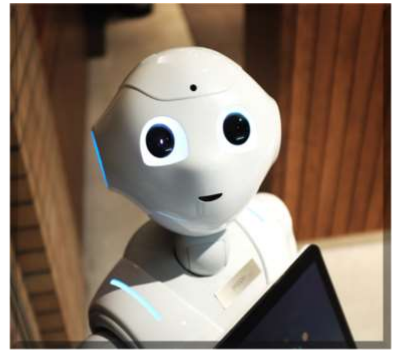
Pictured: Cafes have been set up so customers can go for a cuddle!

The global pandemic has separated us from loved ones so in Japan, robots have become much more popular for helping to tackle loneliness. Companies that produce loveable companions of all kinds, from yellow Minion characters to snowmen, have seen sales of their robot figures shoot up during lockdown. Each robot pal is programmed in a unique way to cheer its owner up with songs, chat or bright flashing lights. Some even have their own internal heating system so they can double up as a hot water bottle! Others squeal and giggle with joy as they are tickled and cuddled. The robots can be quite expensive to buy because of all the sophisticated technology. But some cafes in Japan have begun to offer a chat and a cuddle from one of these intelligent technical buddies alongside their food and drinks menus.