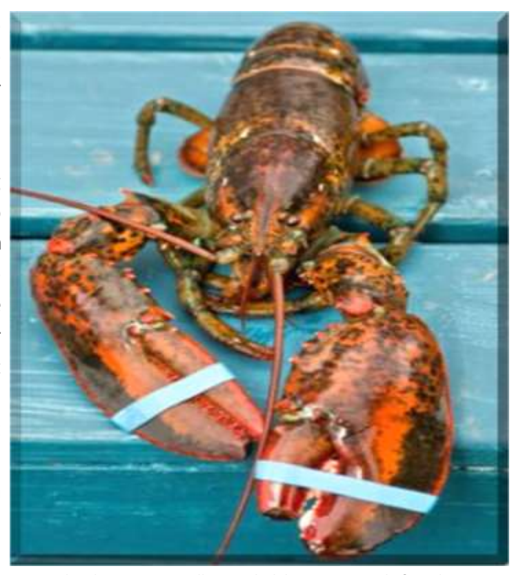
Pictured: Lobsters are usually very dark brown or grey before they are cooked

Caterer, Joseph Lee, was shopping for fish at a wholesale store in Leicester last month when he spotted two very rare lobsters in a fishmonger's tank. As a former fishmonger himself, Joseph was surprised by the colour of the lobsters. Usually living lobsters are very dark brown or grey to help them stay camouflaged in the ocean, but these living creatures were bright orange. Joseph identified them as two very rare Canadian lobsters that should never have been sent for sale in a market. The chances of finding one alive are 30 million to 1, so the chances of finding two alive at the same time is 1 in a billion! Joseph alerted the fishmonger and the lobsters have been given a new home at Birmingham Sea Life Centre instead of being sold. Joseph commented afterwards, 'I couldn't bear the thought that they would end up on someone's plate!' Julian Harvey, local seafood specialist added, 'What a find! Well done to Joseph for spotting them and keeping them safe for others to see. We've never seen them here but then it's a long way from Canada to Cornwall, especially if you're swimming!'